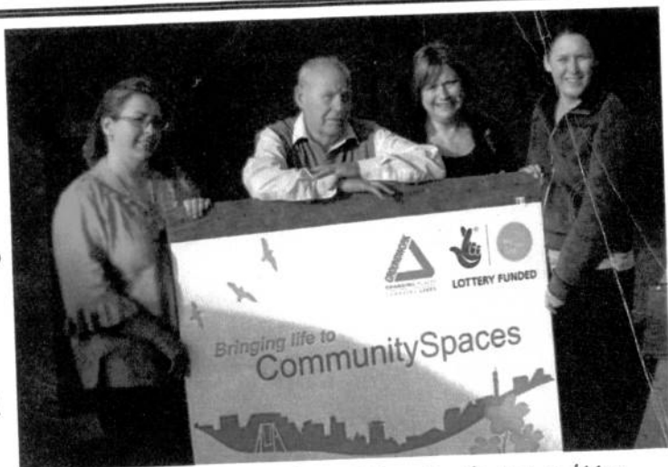
Members of the Ingham Play Park Committee

Their work has included seeking guidance from local and regional advisors. The committee have liaised with the Eskdaleside Cum Ugglebarnby Parish Council and the Borough Council to negotiate the long-term maintenance of the play park.