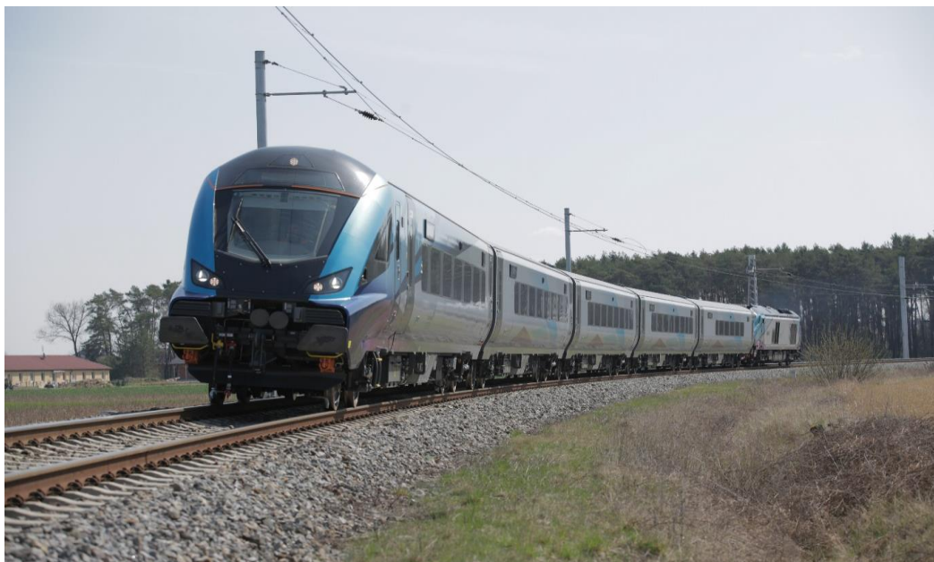
Figure 2 - Future TransPennine Express train from Scarborough / Seamer