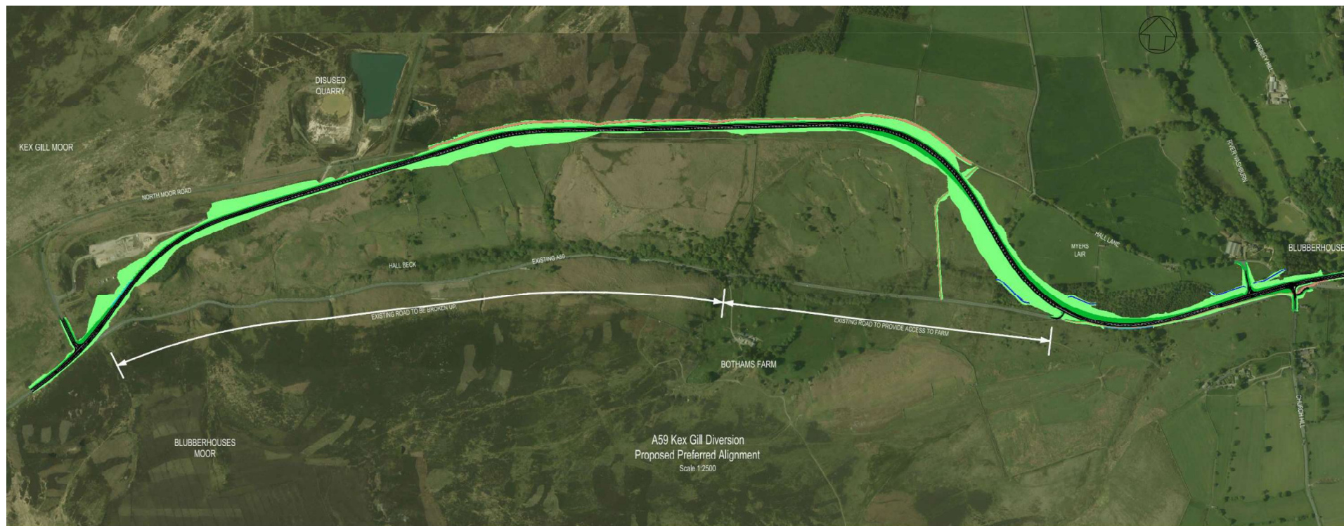
A59 Kex Gill diversion route alignment, to northern valley side; circa 4km new highway and abandonment of existing on southern side.