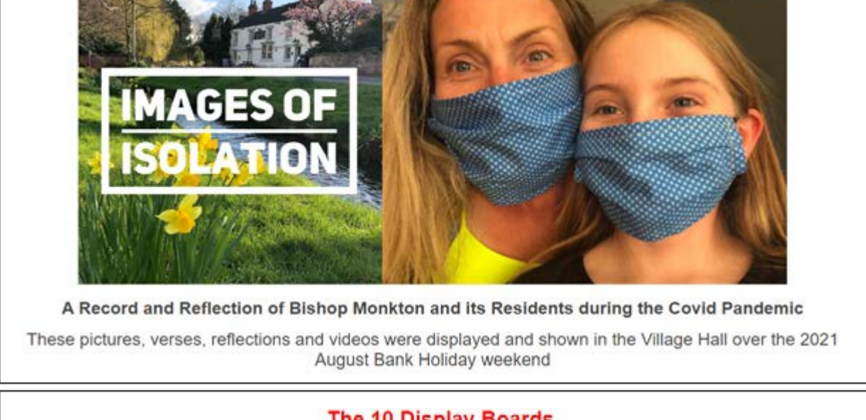
A Record and Reflection of Bishop Monkton and its Residents during the Covid Pandemic. These pictures, verses, reflections and videos were displayed and shown in the Village Hall over the 2021 August Bank Holiday weekend

Photo exhibition records North Yorkshire village life during Covid - BBC News