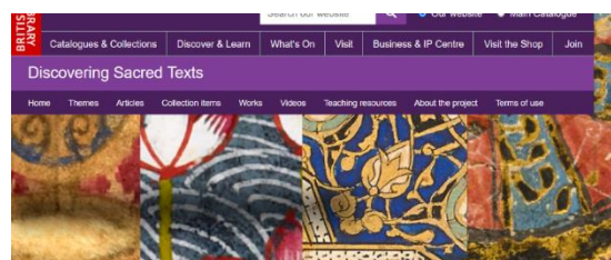
Discovering Sacred Texts: Key Stage 2 teaching resources

Bring sacred texts to the classroom with these fascinating resources from the British Library. The resource covers Hinduism, Buddhism, Sikhi, Judaism, Christianity and Islam. Find out more here: https://www.bl.uk/sacred-texts/activities/key-stage-2-teaching-resources