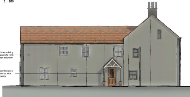
Side (West) Elevation 1 : 100

THIS DRAWING HAS BEEN MADE BY ME OR UNDER MY SUPERVISION AND I AM A REGISTERED ARCHITECT OR ARCHITECTURAL TECHNOLOGIST AND I AM NOT PROVIDING THIS DRAWING AS A PROFESSIONAL SERVICE UNLESS I AM REGISTERED AND I AM NOT PROVIDING THIS DRAWING AS A PROFESSIONAL SERVICE UNLESS I AM REGISTERED AND I AM NOT PROVIDING THIS DRAWING AS A PROFESSIONAL SERVICE UNLESS I AM REGISTERED