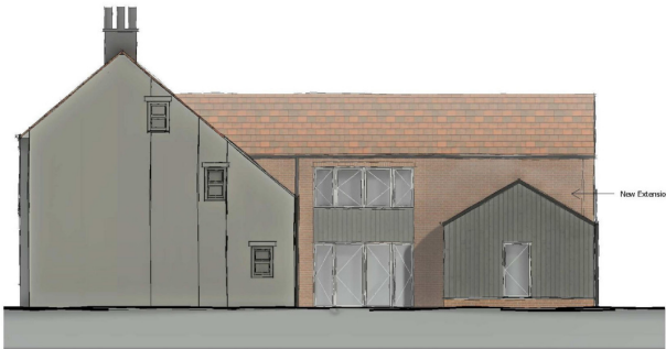
Side (East) Elevation 1 : 100